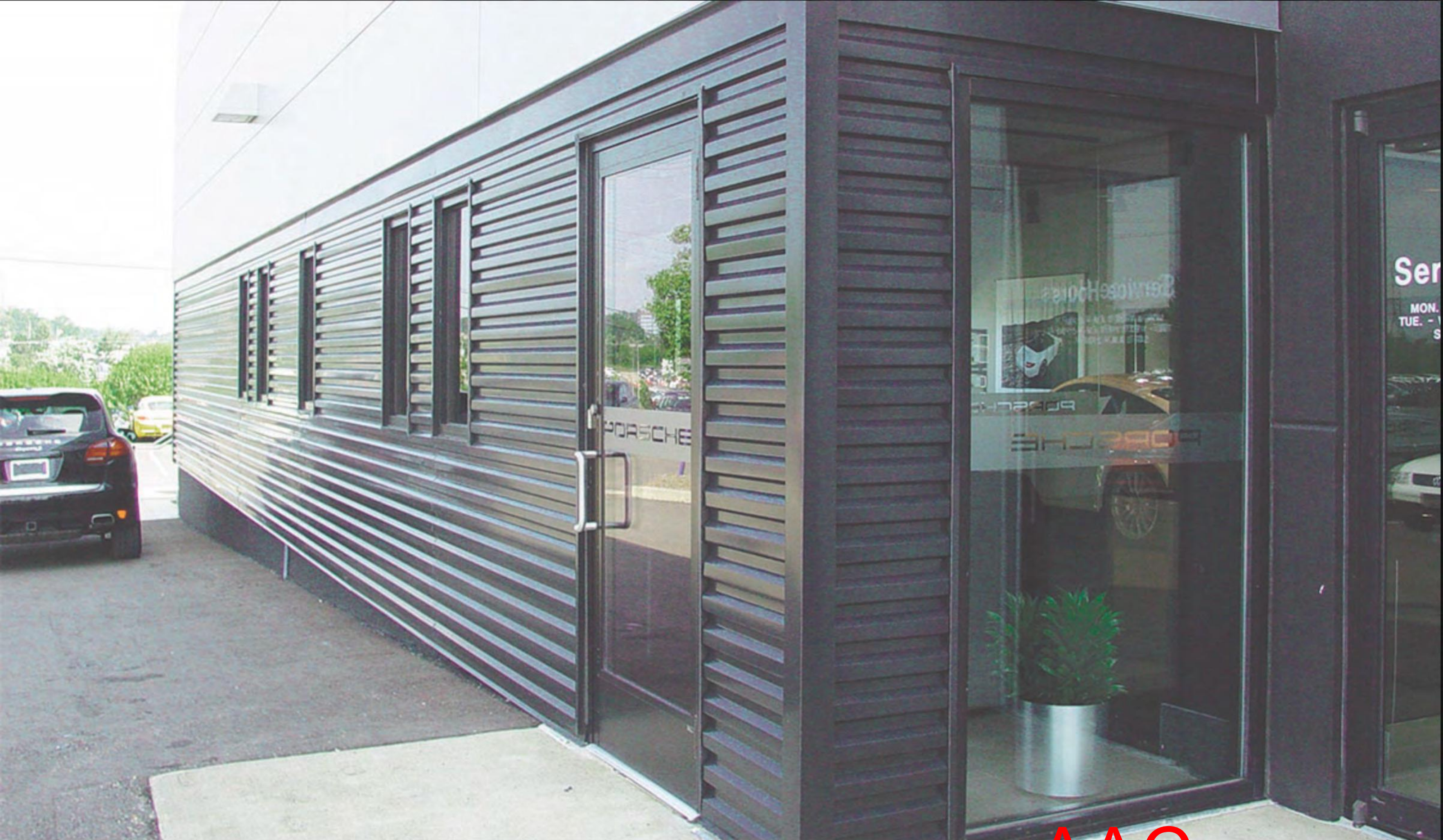
Porsche of Farmington Hills | Farmington Hills, MI