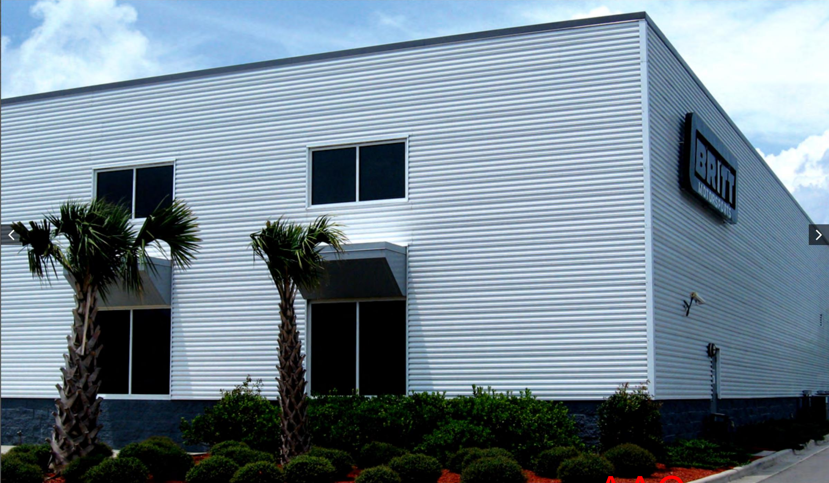
Britt Motor Sports | Wilmington, NC Rigid Wall: Bone White