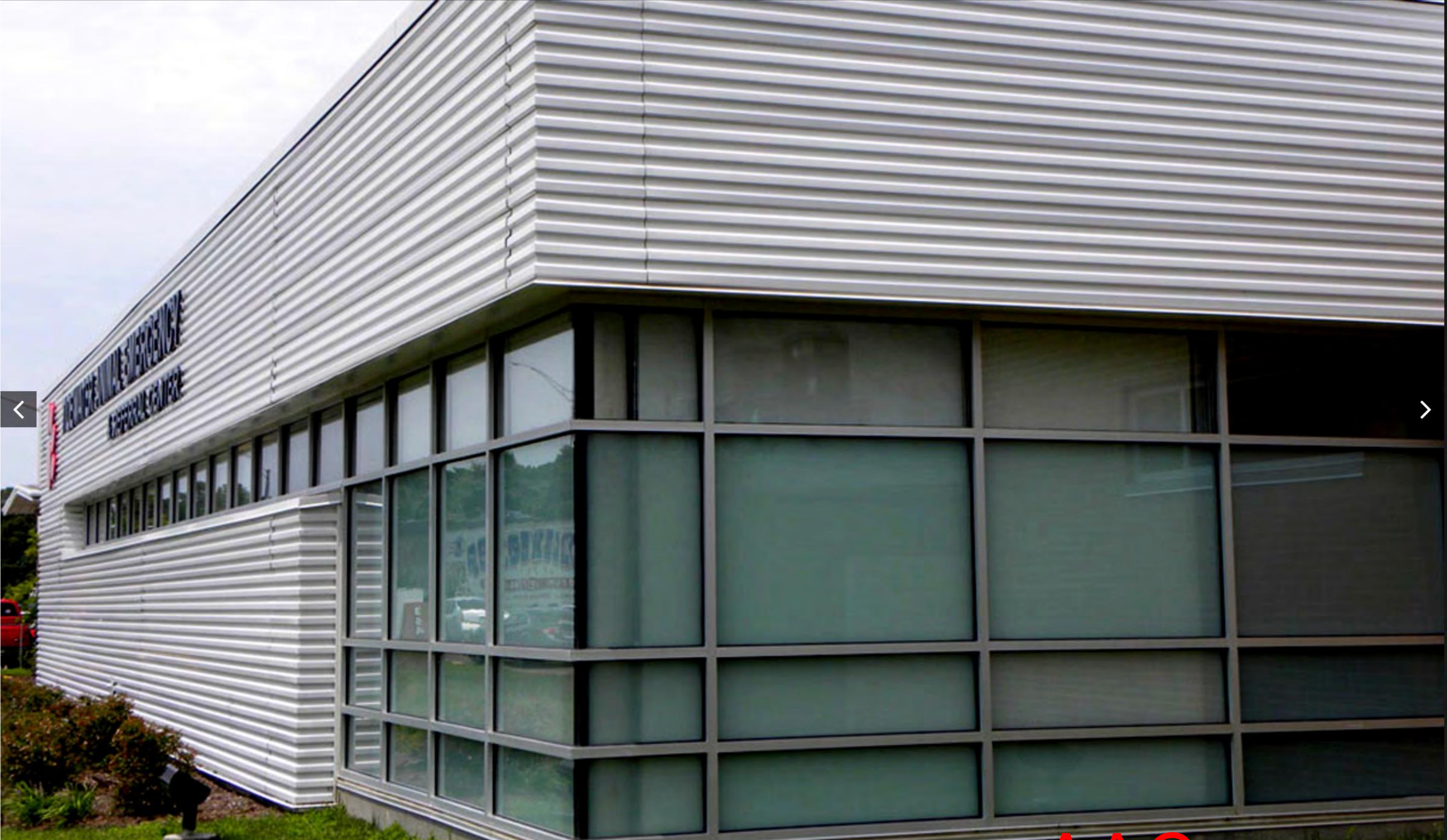
Animal Critical Care | Virginia Beach, VA Rigid Wall: Ascot White