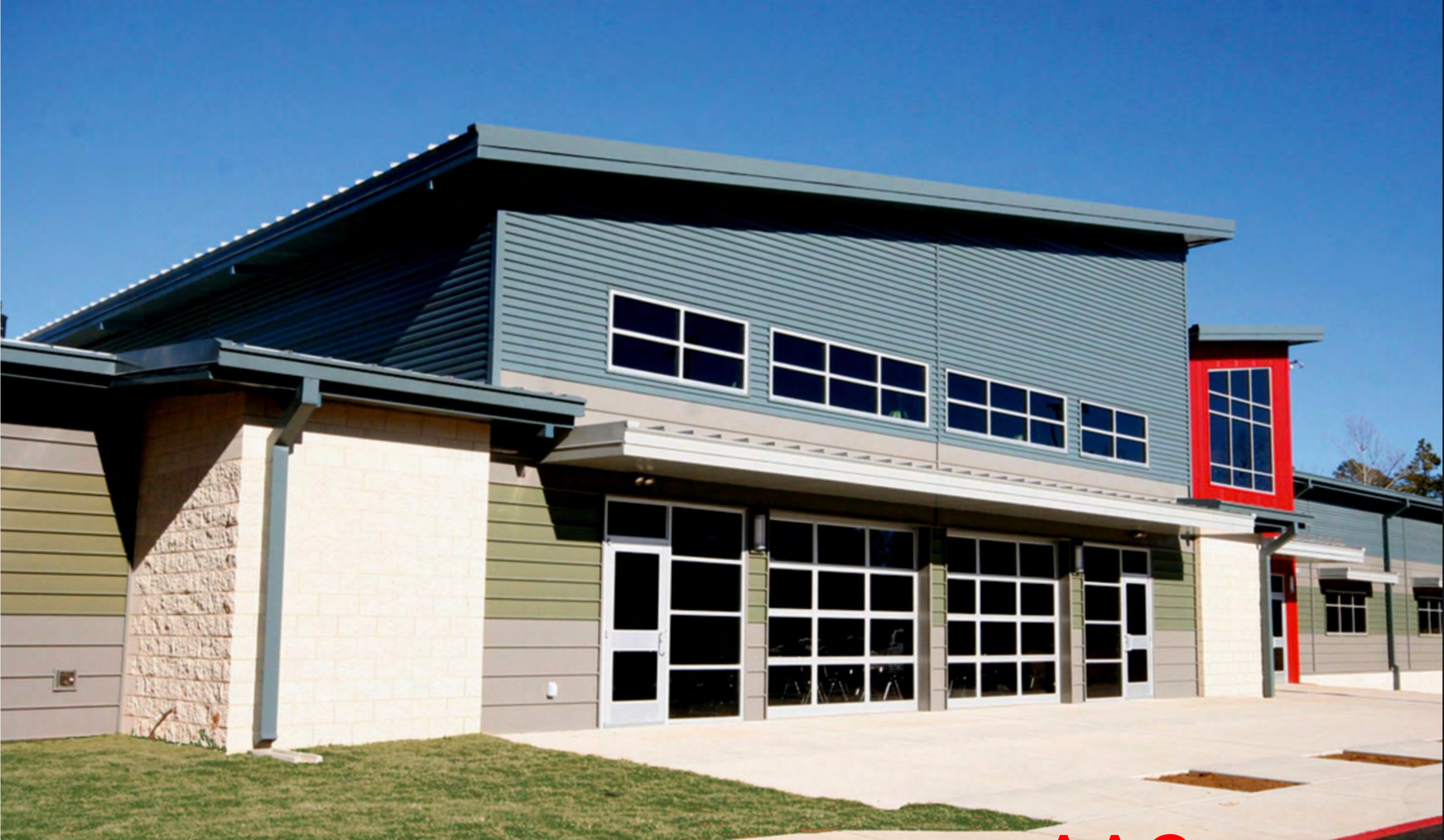
Eureka Springs High School | Eureka, AR

Rigid Wall: Rocky Grey | Multi-Purpose Panels (MPN080 & MPN120): Slate Grey, Antique Patina | Belvedere 6" Short Rib: Brite Red