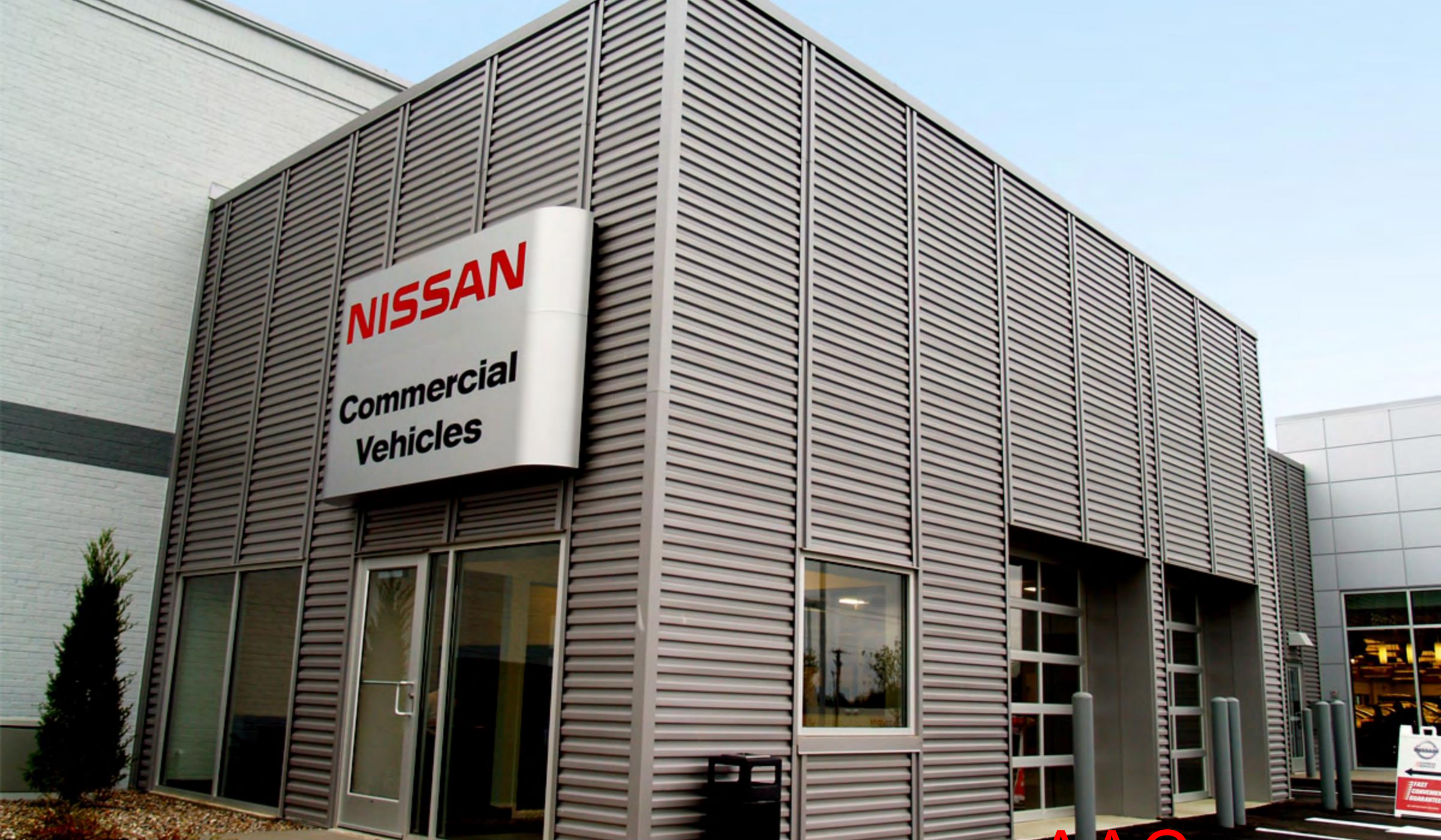
West County Nissan | Manchester, MO Rigid Wall: Silversmith