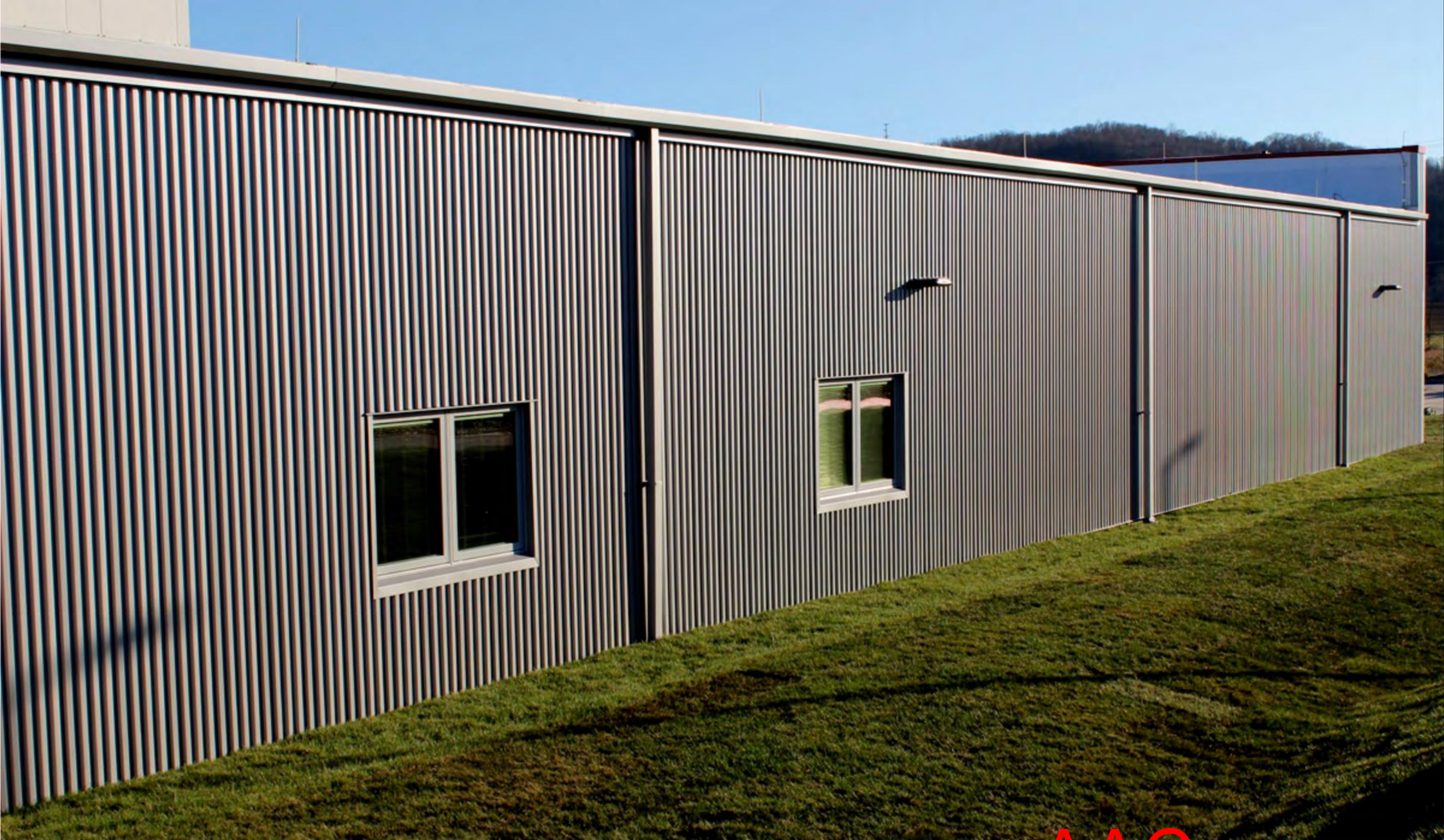
Sheetz Schwellness Center | Claysburg, PA Rigid Wall: Silversmith