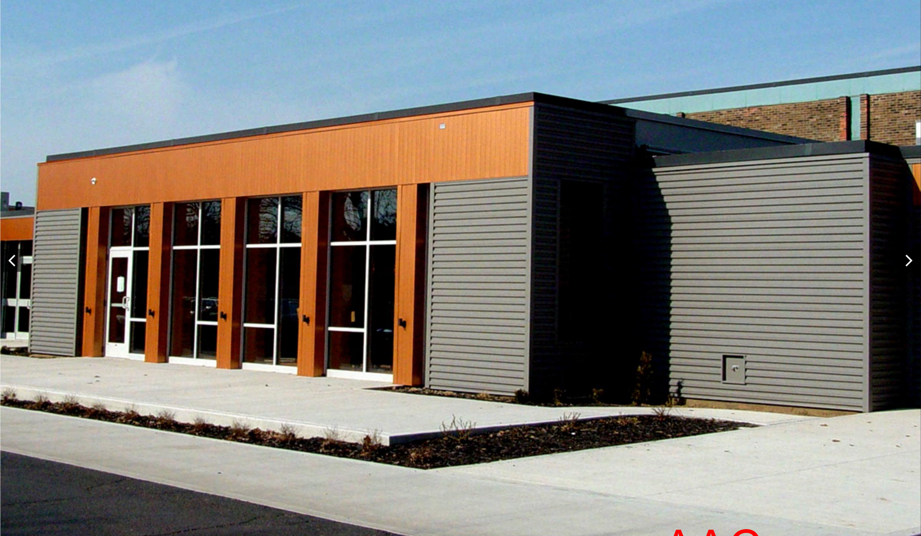
Life Stream Church | Allendale, MI Rigid Wall: Slate Grey | Opaline (OPF040): Coppertone