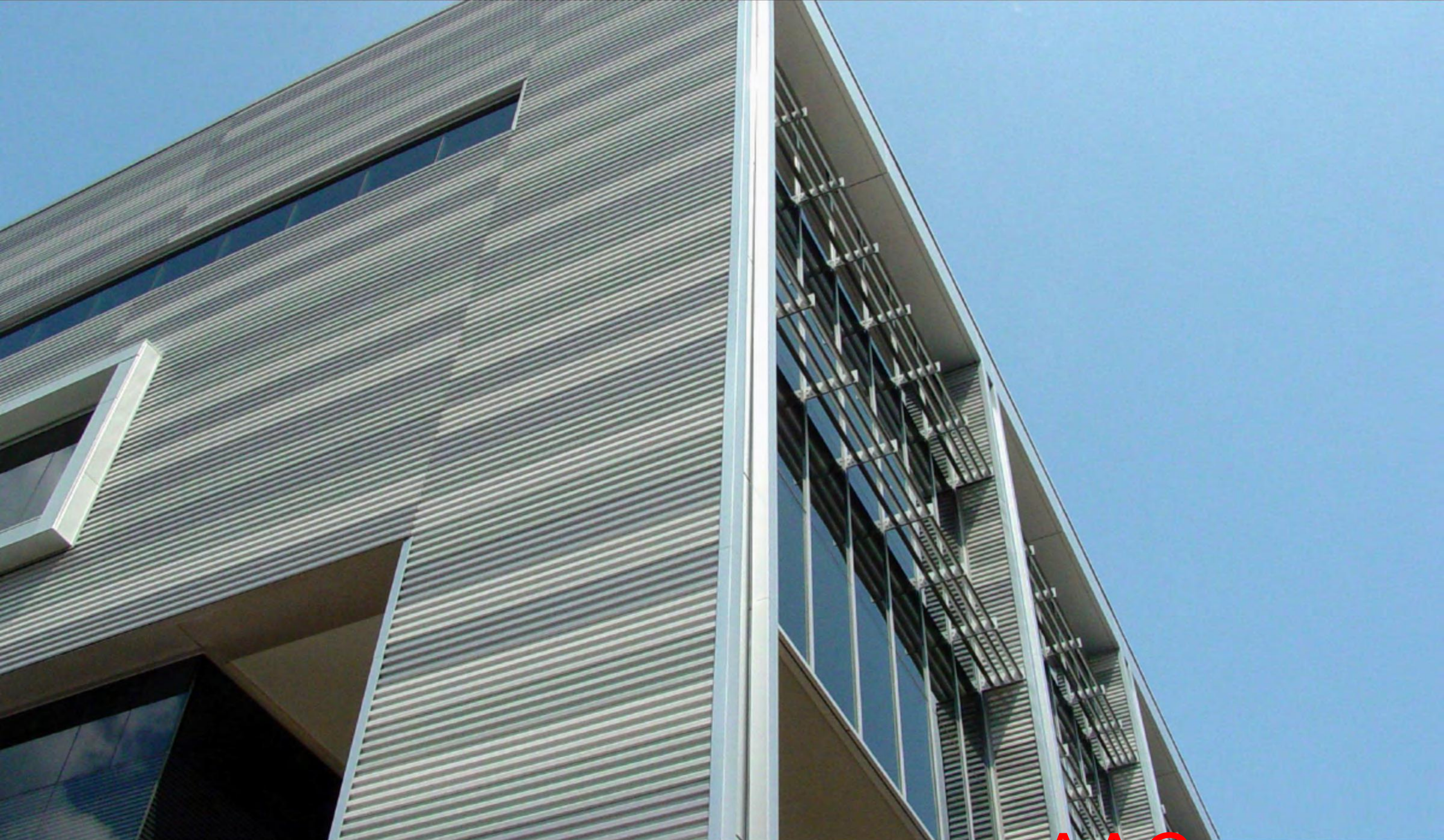
Ann Arbor Municipal Building | Ann Arbor, MI Rigid Wall: Dove Grey, Silversmith, Custom Grey