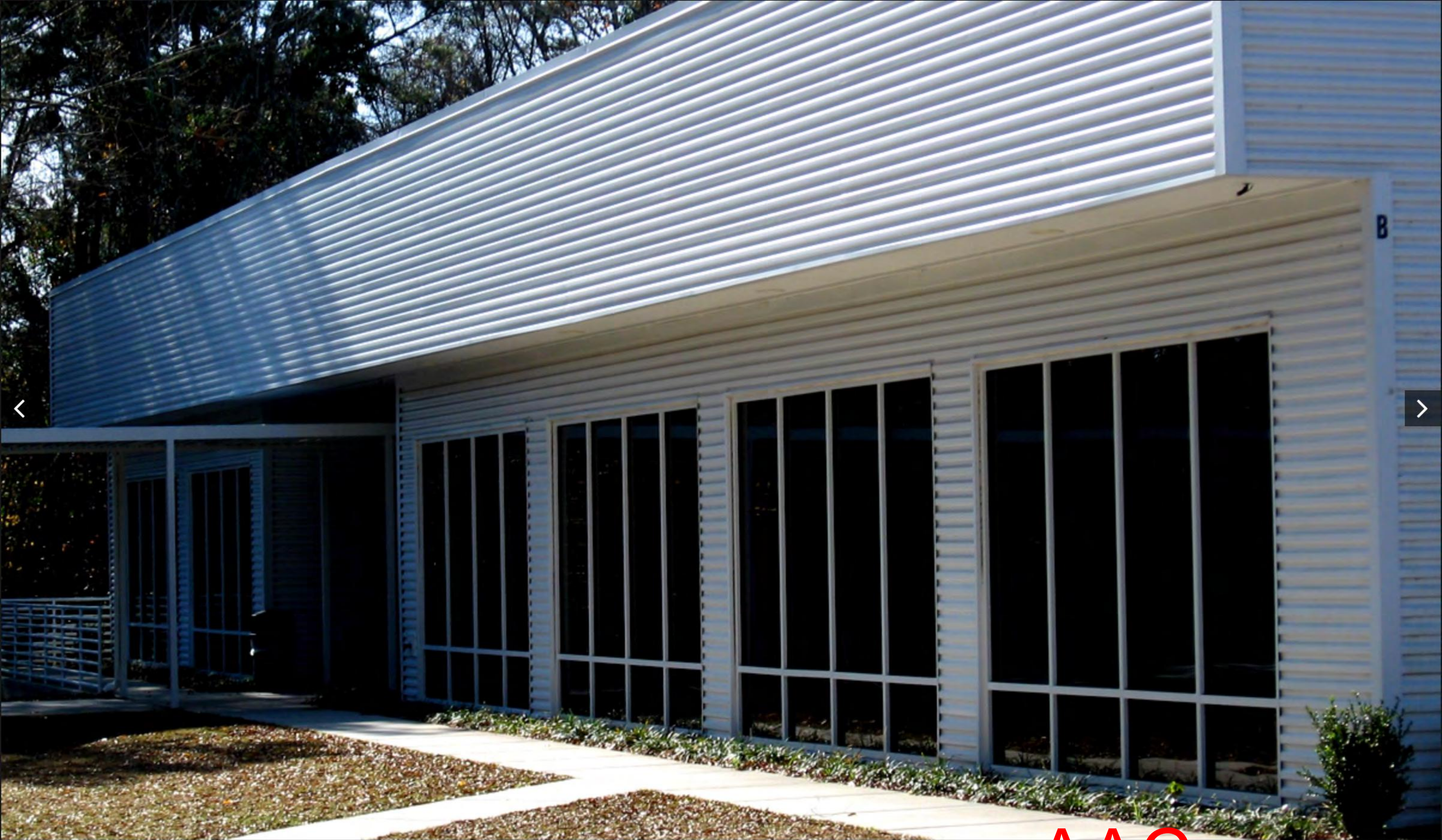
Treatment Center | Wilmington, NC Rigid Wall: Bone White