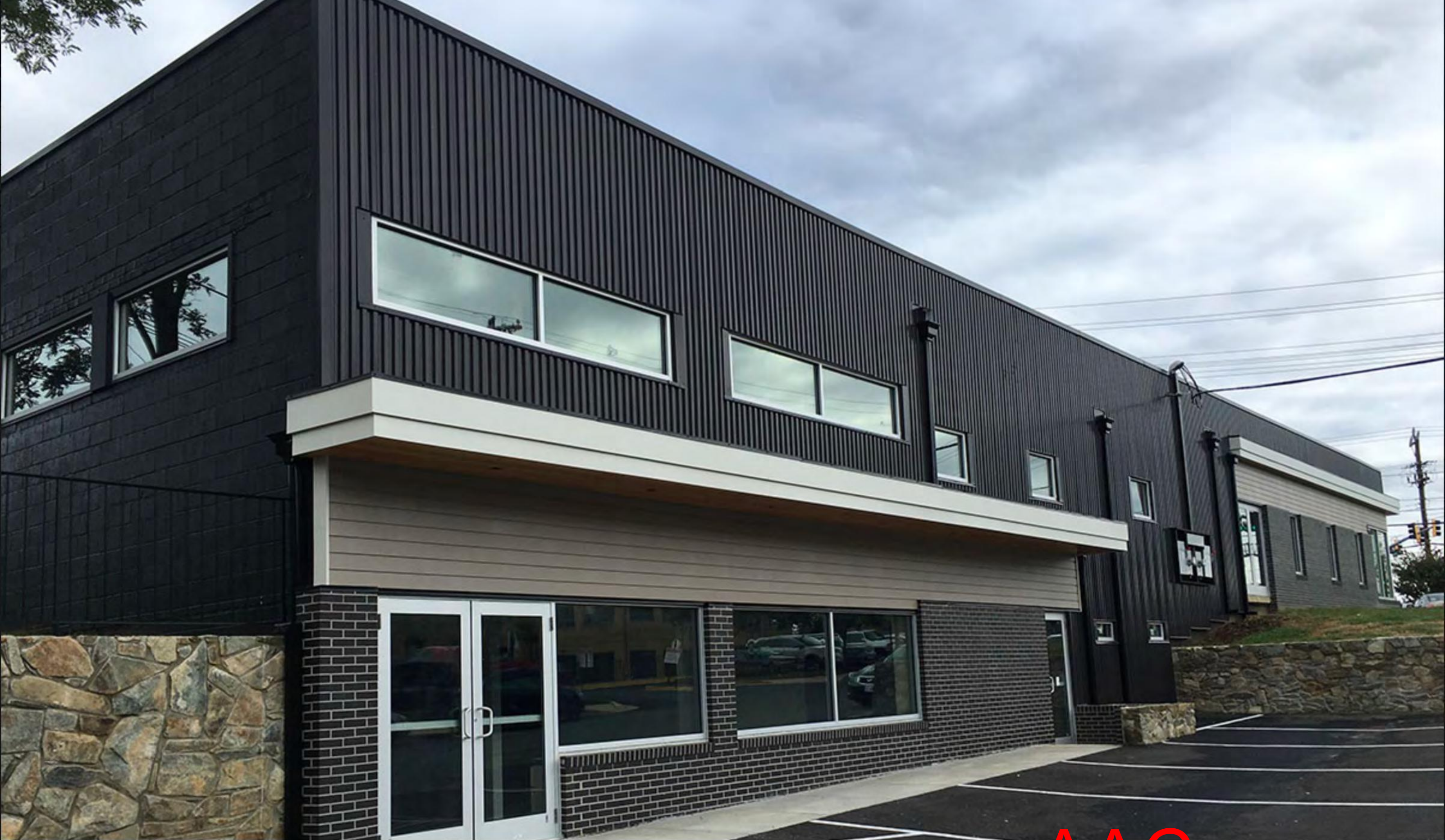
Rockville Pike | Rockville, MD Rigid Wall: Black