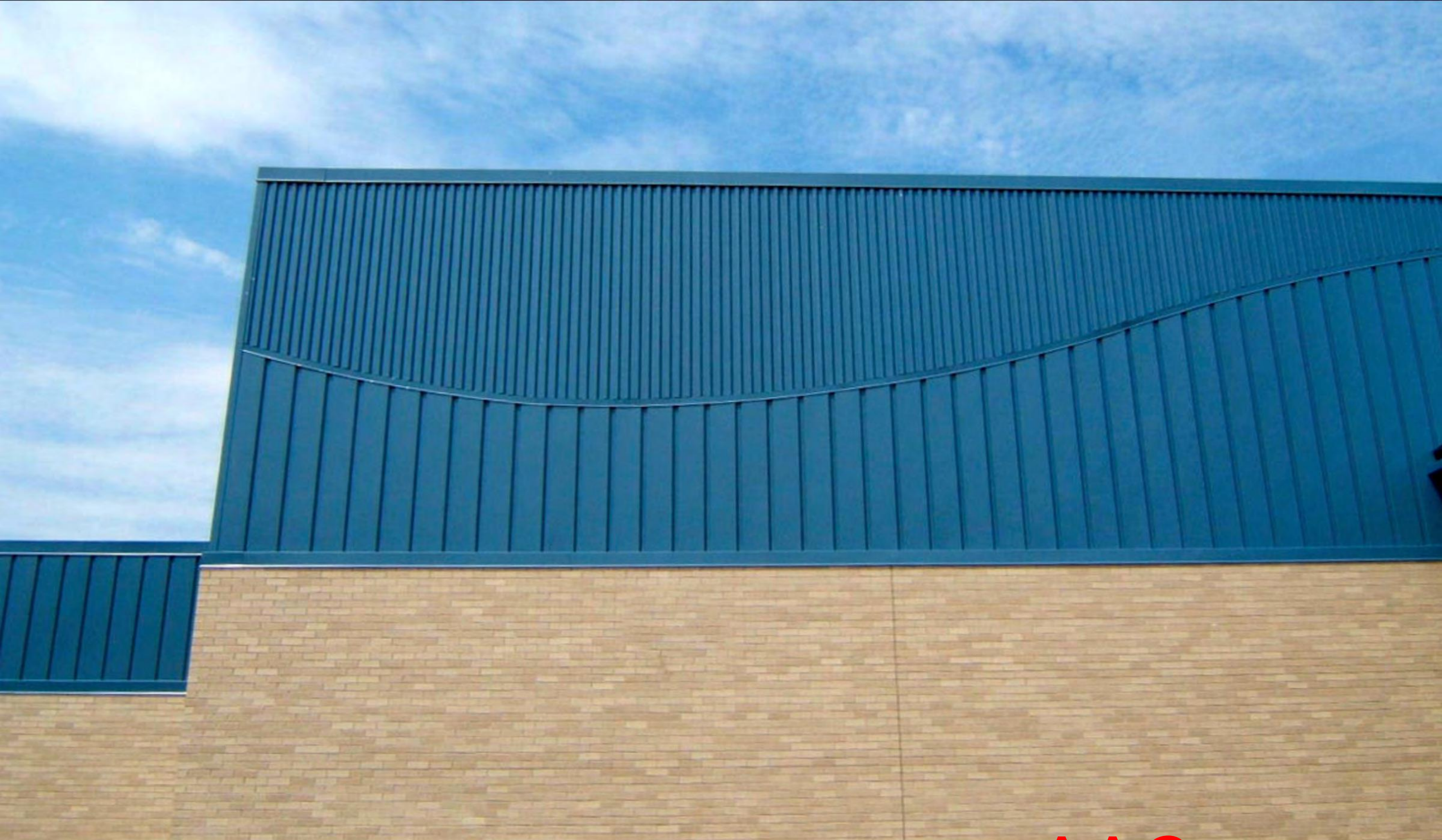
Prairie Elementary School | Adrian, MI Rigid Wall: Custom Blue | Multi-Purpose Panel: Custom Blue