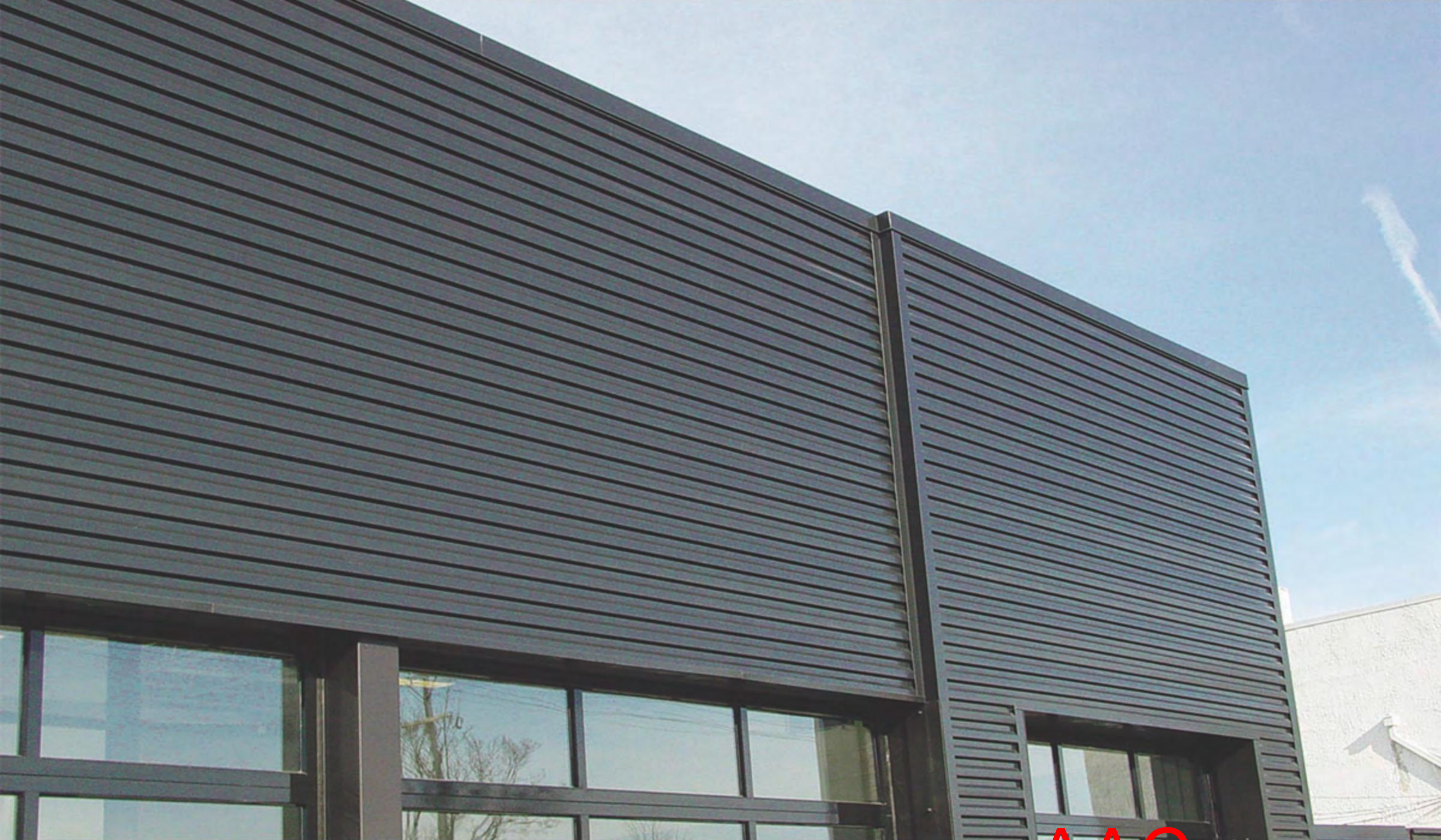
Fred Lavery Porsche | Birmingham, MI Rigid Wall: Black